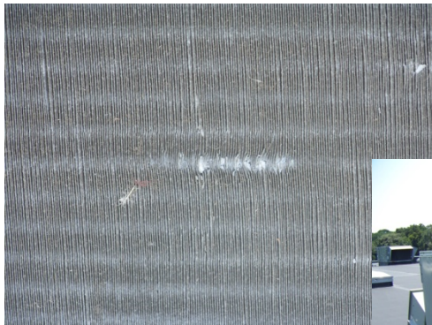
Above: Ocean facing MicroGuard coated condensing fins after 7 years

After 7 years, the windward (ocean facing) condenser fins were soft, but still serviceable, the leeward condenser fins were slightly firmer and interior condenser fins were very firm and in good to excellent condition. All copper tubing shiny. The evaporator fins and copper tubing were in excellent condition, firm and free of mold, mildew, and patina. Exterior cabinets had not faded and reflect minimal corrosion. On the 2 replacement units, the uncoated evaporator coils reflected build-up of mold/mildew and copper had patina.