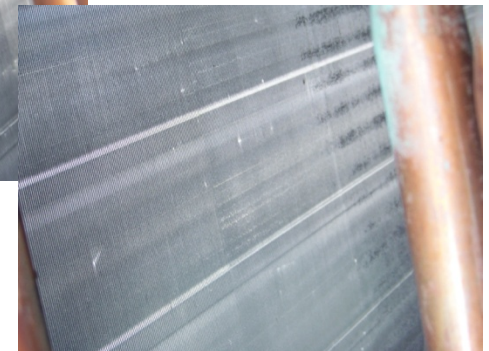
Below: Uncoated evaporator coil after 18 months; mildew on fins, patina on copper