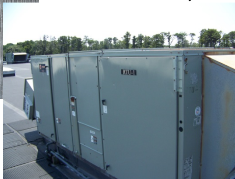
Below: MicroGuard coated cabinet off ocean after 7 years